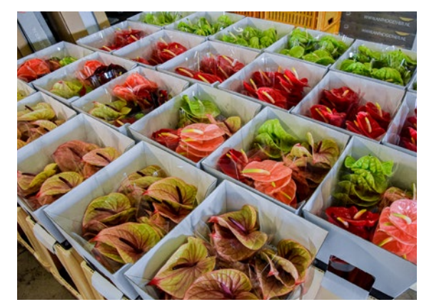
Anthurium packed on water