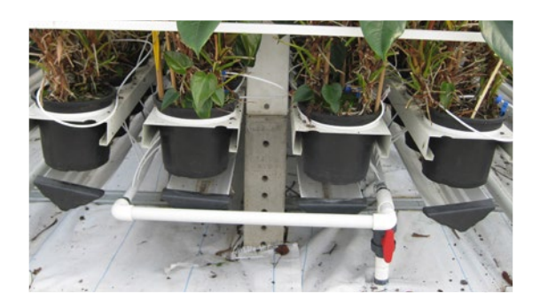
Cultivation in a pot system