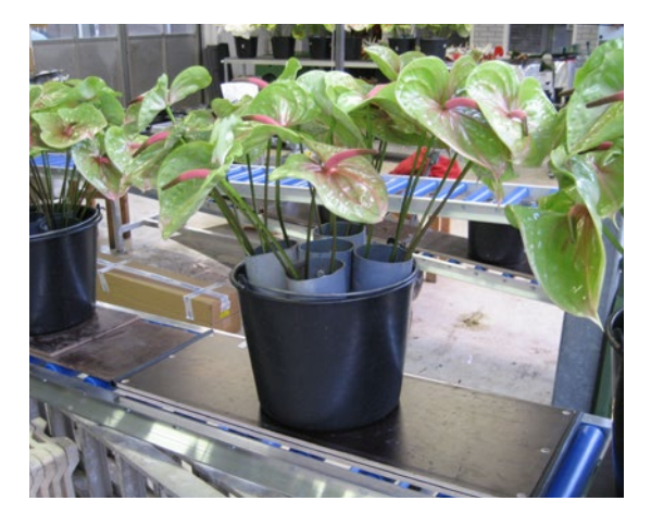
Bucket provided with tubes, wooden plate as spacer