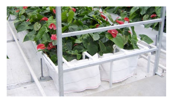
Cultivation in a W-gutter system