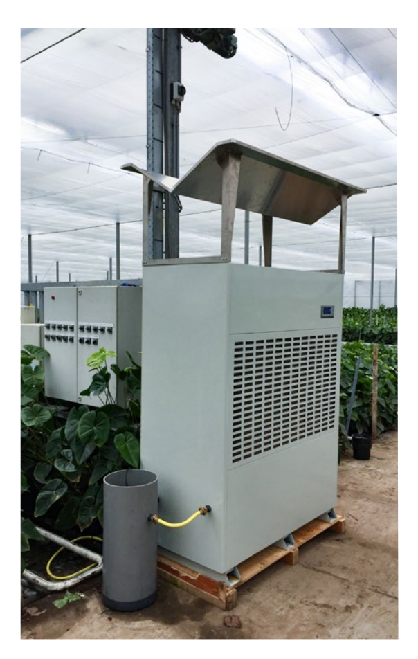
Dehumidifying greenhouse air

Although anthurium can be grown moist, they definitely need basic moisture removal. This can be done by using dehumidifiers in addition to conventional moisture removal (by tube, screen gap, etc.). When these machines are used, water is extracted from the greenhouse air and actually removed from the greenhouse. Drainage of moisture due to higher tube temperatures often actually stimulates evaporation too much, requiring unnecessary additional moisture removal.