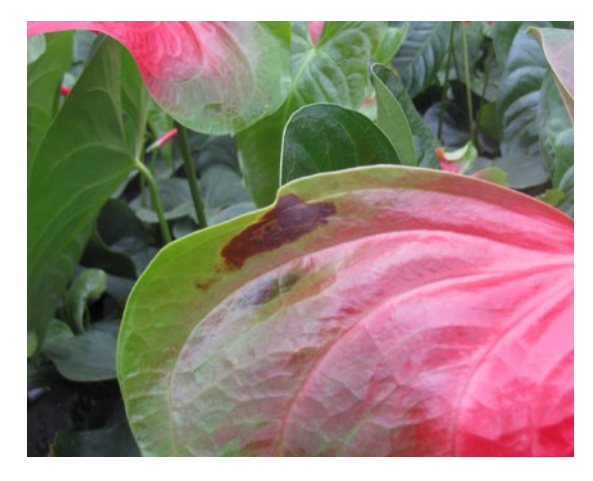
Brown spots caused by calcium deficiency

No ammonium should be given as it significantly lowers the pH. During cultivation, the pH of anthurium already drops significantly by nature. An optimal K:Ca ratio is around 1.2:1.