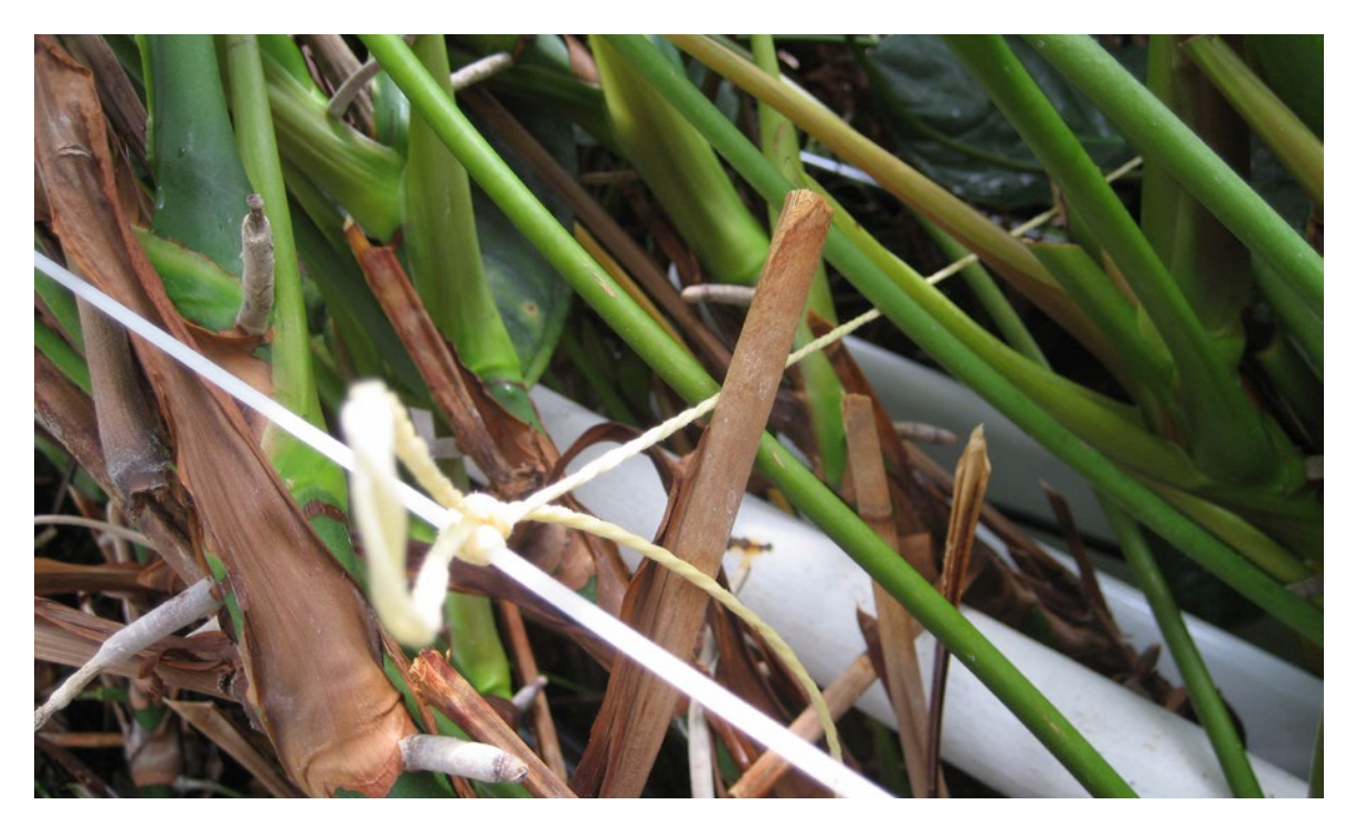
Crop steering by means of cross-wires

Aiming crops to prevent falling After 3-4 years of cultivation (depending on the cultivar), the crop starts falling over. To manage this, timely training is needed. These days, this is mostly done by the intermediate wire system. Further optimization of crop training is now also done with an intermediate wire in the middle of the crop or with mesh.