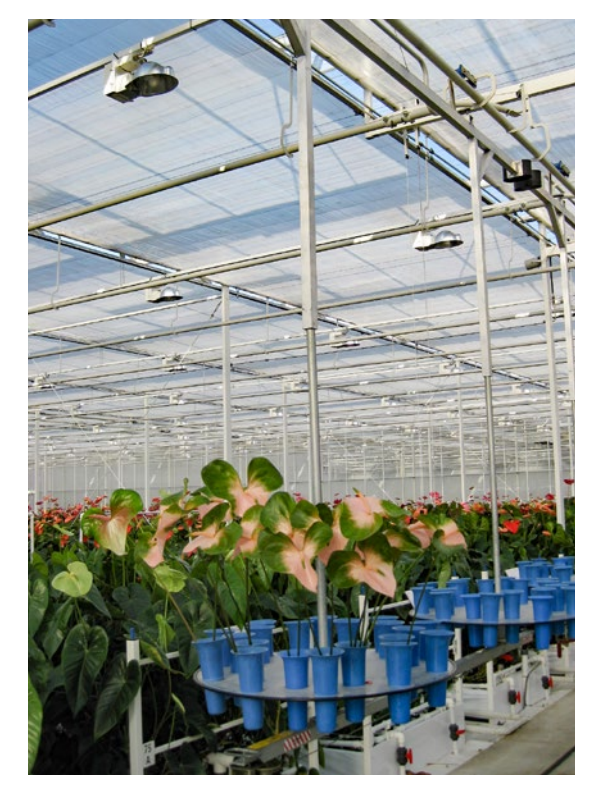
Hanging harvesting system in combination with the upper net of the heating

When the flowers are cut, they are transported to the shed using harvesting systems. Usually, harvest carts with a mast are used, which is fitted with a carousel with harvest vases on both sides. In the shed, the flowers are then manually sorted by size. By means of an internal transport system, the packing stations are fed with a constant supply of anthurium cut flowers.