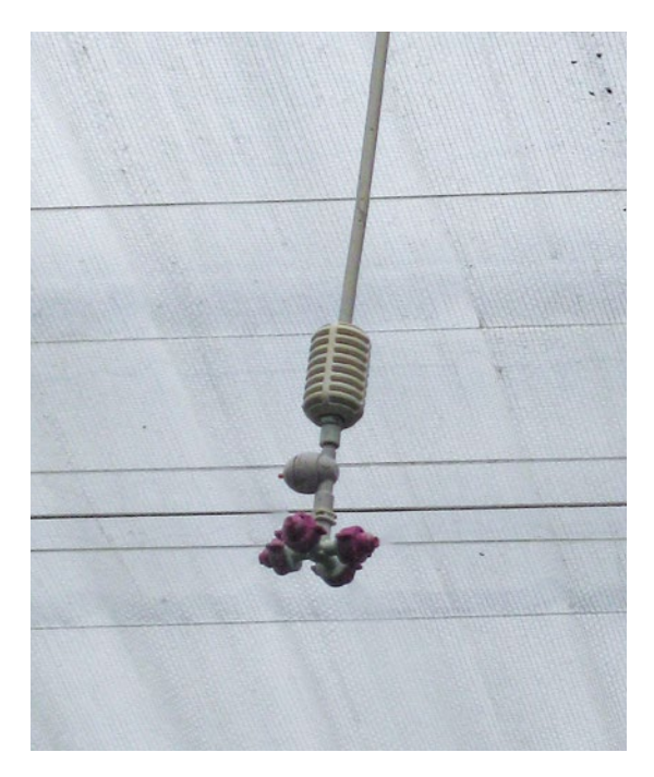
Simple low-pressure humidification

This is especially annoying for employees. During crop work, they often have to work in a rain suit or with a plastic apron. The concrete paths also become wet and slippery.