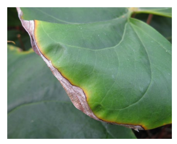
Leaf margins caused by high sodium

Water must be free of chemicals, visible contamination, and diseases. Elements like sodium and chlorine should stay below 4 mmol/ litre, and bicarbonate levels ( HCO_3 ) should not be too high either (<6 mmol/l). In the absence of optimum water, water partially treated by osmosis must be used.