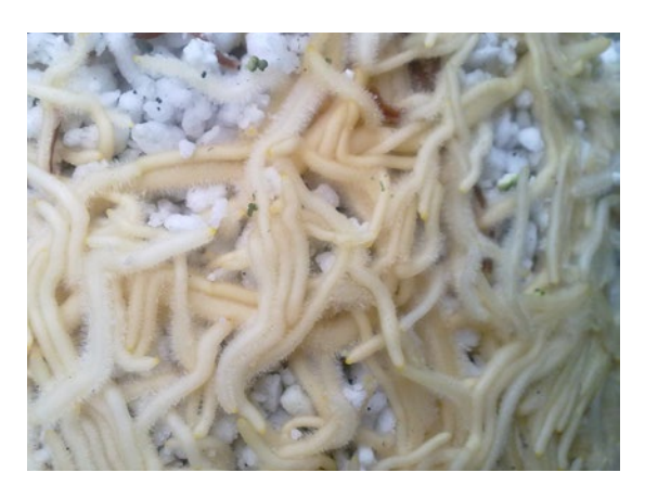
Excellent root growth in perlite

The anthurium grows best in an airy substrate due to its predominantly epiphytic growth habit. The most commonly used substrate types are rock wool cubes (2 x 2cm), perlite 1x perlite weg and oasis.