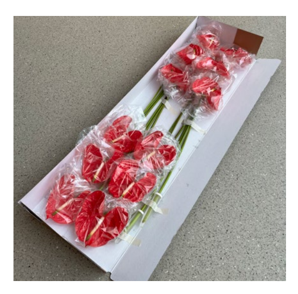
Packaging method Europe

The packaging method depends on what the market prefers. The main packaging method is the single-use auction box. The stems are cut at an angle at the packing stations and provided with a bottle of water. The flowers (bract) are then fitted with a transparent plastic bag and the flowers are packed individually, by sticking them to the bottom of the box. For now, this is largely a manual process. Depending on the diameter of the bract, a box can take 8, 10, 12, 16 or 20 flo-wers. The most common diameters are 11-13 cm (16 per box) and 13-15 cm (12 per box). It is also possible to pack the flowers in a flow pack. This is usually done at the request of the buyer and depends on the market. For air export, the flowers are also glued to the inside of the lid. Of course, this is customized and only upon request.