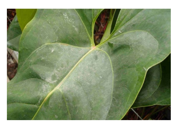
Leaf contamination caused by chalk or nutrient elements from the water

Use clean water such as rain or osmosis water for humidification. When this is not used, the crop and flowers become contaminated with lime or algae deposits.