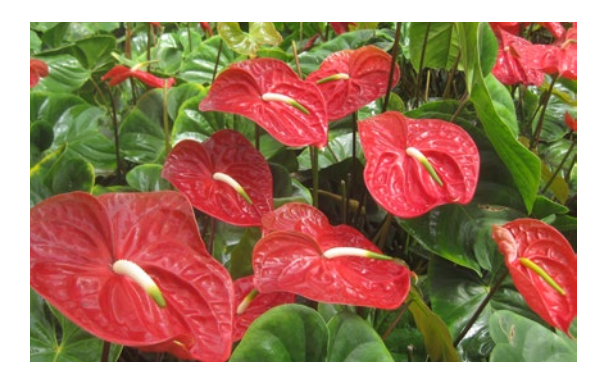
Situation due to combination of leaf halving and young leaf breaking