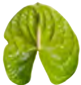
16 months (production 50%)