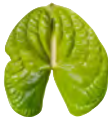
20 months (production 100%)