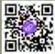
watch our Unoform video

With Unoform we offer uniform plant material and a choice of three different product types. After all, high quality starting material is the foundation for successful cultivation.