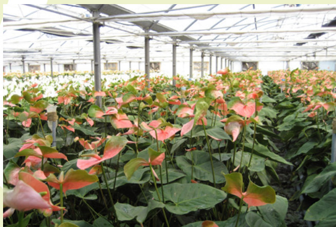
Young leaf-breaking crop with flowers standing above the crop

This system starts with young leaf-breaking, after first building the optimal plant by means of the half-leaf system. The advantage of young leaf-breaking is that the production and quality increase and the need for labour decreases (less leaf cutting). Production can increase by 10%-25% depending on the cultivar, and the flower size can be 0.5-1.5 cm larger. The plant does not have to put any energy into the formation of leaves. Young leaf-breaking cannot be carried out continuously. After breaking off 2-4 leaves (4-10 months), they need to be replaced. The new leaf stands higher above the old leaves, as a result of which the light incidence in the bed improves strongly (optimal crop architecture). Young leaf-breaking should take place every week. When it is done for too long, the flower quality can diminish (less calcium uptake), the flower stem can become too short and the plant photosynthesis can decrease (noticeable by old/yellow leaves).