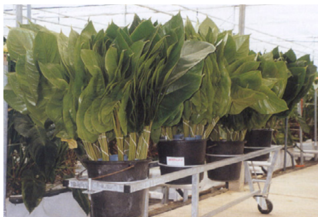
Anthurium leaves can also be sold, depending on the variety

We hope that after reading this short cultivation guide you have gained some insight into the Anthurium cut flower cultivation. This specialist cultivation is simple to perform, provided that certain conditions are met. If you fulfil these conditions, the result will be beautiful, long-lasting flowers, which deserve a good place on the market. If you have any questions or queries, please be sure to contact us.