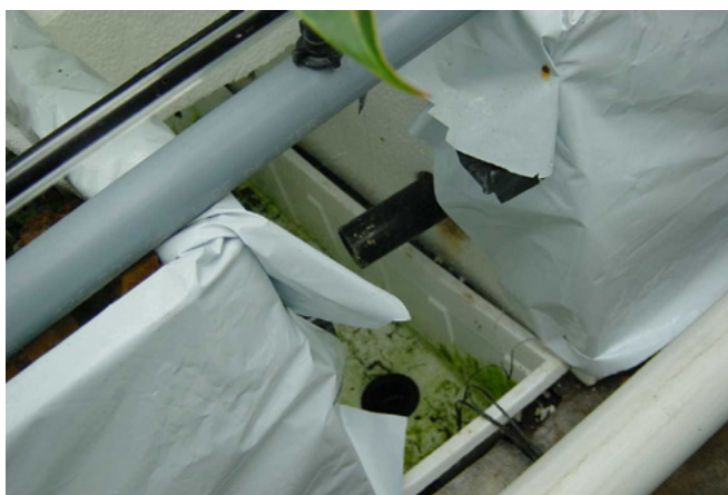
Optimal drain collection system in which obstruction cannot occur and controls can be carried out easily