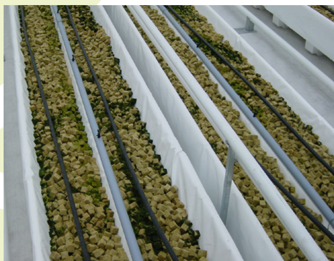
Combination of two rain and four drip systems