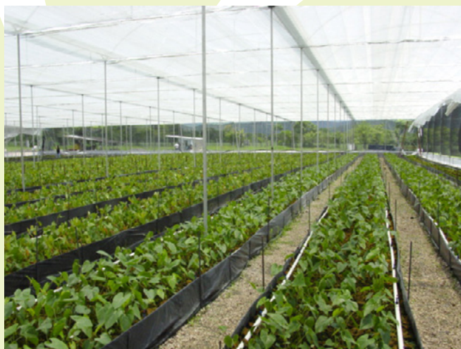
High greenhouse with oasis as substrate and 180° nozzles

It is important for all cultivation systems and substrates that a suitable irrigation system is installed. Our preference is for a system with both irrigation pipes (two pipes per bed, with 360° nozzles with a 60 cm nozzle distance, releasing 40-60 litres per hour per nozzle) and a drip system (20-25 cm dropping point distance: 1-2 litres per hour per dropping point). By preference you should use lockable nozzles/drippers.