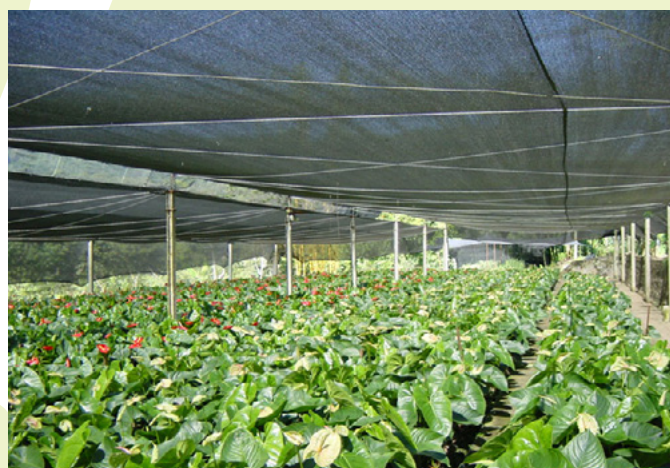
Schaduwhal in de tropen

In order to make an accurate analysis of subsequent cultivation