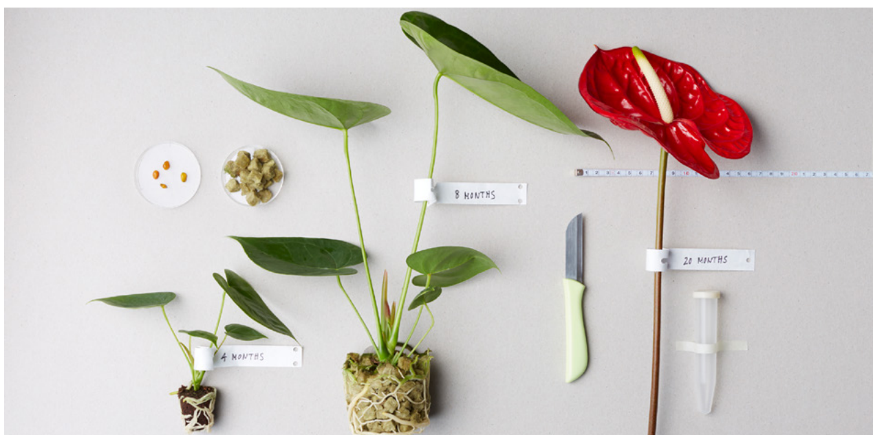
10-15 cm plant, 20-25 cm plant and a flower ready for sale (from left to right)

the plants too deep, as then it could start stretching excessively. Too shallow is not good either, because then the plant will slowly grow out of its medium and quickly topple over. A good guideline is that the aerial roots just enter the medium, the growing point still being able to catch light. Be careful: the plugs cannot be planted yet, they should first be cultivated.