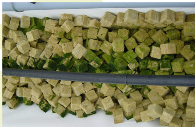
Rock wool cubes of 2 x 2 x 2 cm