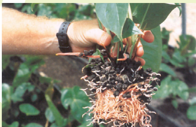
The ideal planting depth

Anthuriums are grown in soil as well as in beds, pots or gutters. Preference is given to cultivation systems that are separate from the soil. In addition, cultivation on gutters is recommended. This cultivation method uses a smaller substrate volume and the water supply is better. In pot cultivation, the dripper is usually the weak link. Irrigation is never optimum as the number of plants in a pot varies. With the cultivation methods mentioned above, the substrate is separated from the soil, which helps to prevent diseases and pests from the soil reaching and affecting