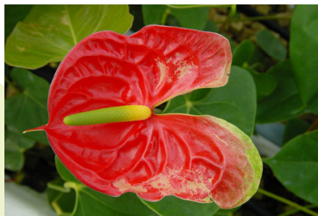
Cork damage in the flower

The water consumption of the cultivation depends on the climate, the substrate and the age of the crop. To a great extent, the relative humidity in the greenhouse determines