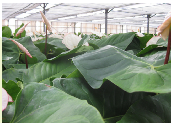
Lack of light incidence as a consequence of a traditional system

As Anthurium grows according to the principle of leaf-flower-leaf-flower, it is necessary to carry out crop maintenance on the leaves. This can be done in different ways.