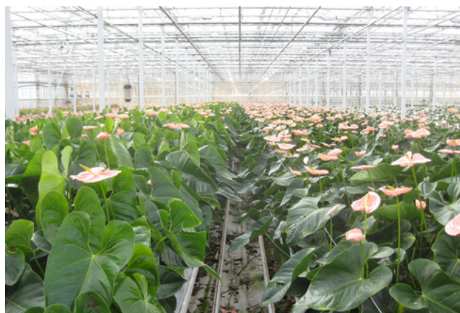
On the left, traditional cultivation; on the right, with young leaf-breaking