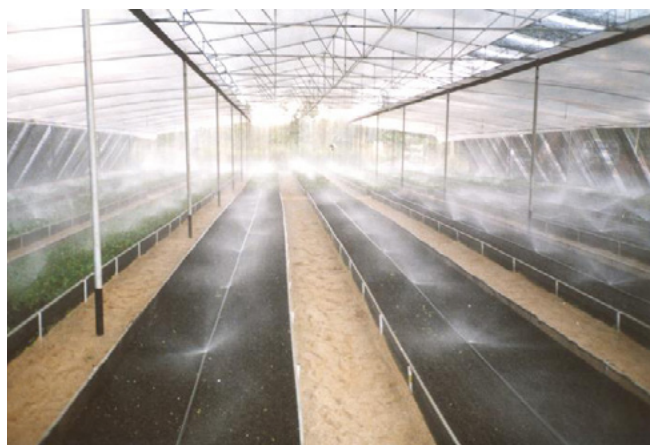
Growing bed with lava stone and 360° nozzles

Water must be free of chemicals and visible contamination diseases. Elements like sodium and chlorine must remain below the 4 mmole/litre level and the bicarbonate ( \text{HCO}_3 ) may not be too high either (<6 mmole/l). In the absence of optimum water,