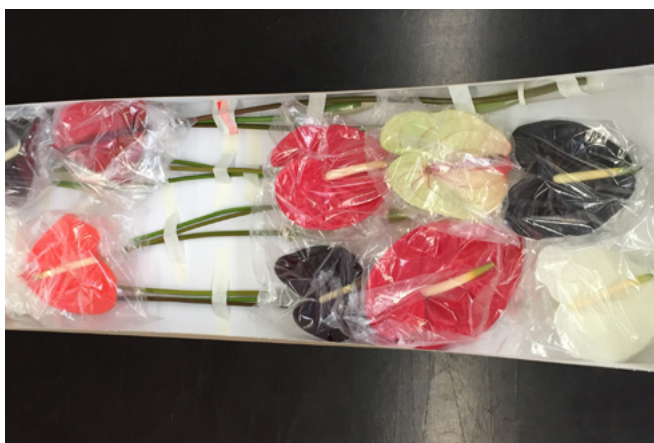
Anthurium flowers in a box